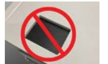
611 No Cutout