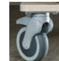
602 Five" Casters