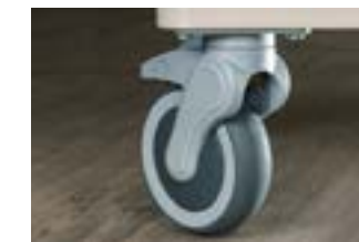
602 Five Inch Casters