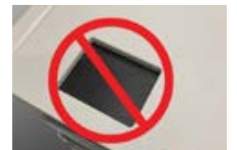
611 No Cutout