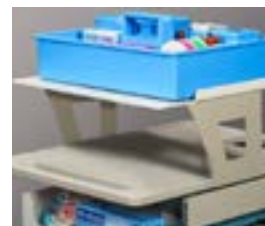
Elevated Surface for tray or laptop