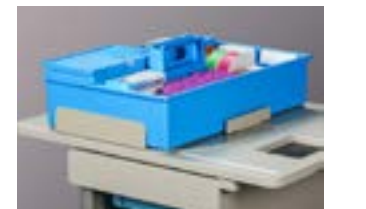
612 Sliding Tray Holder