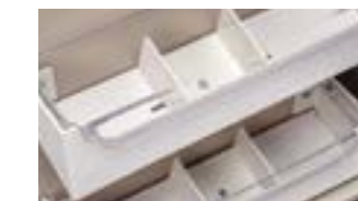
Covered, Sliding, Side Bins -608-3 Set of Three, 15.75" x 4" Covered, Sliding Tray, Side Bins for left or right side of door