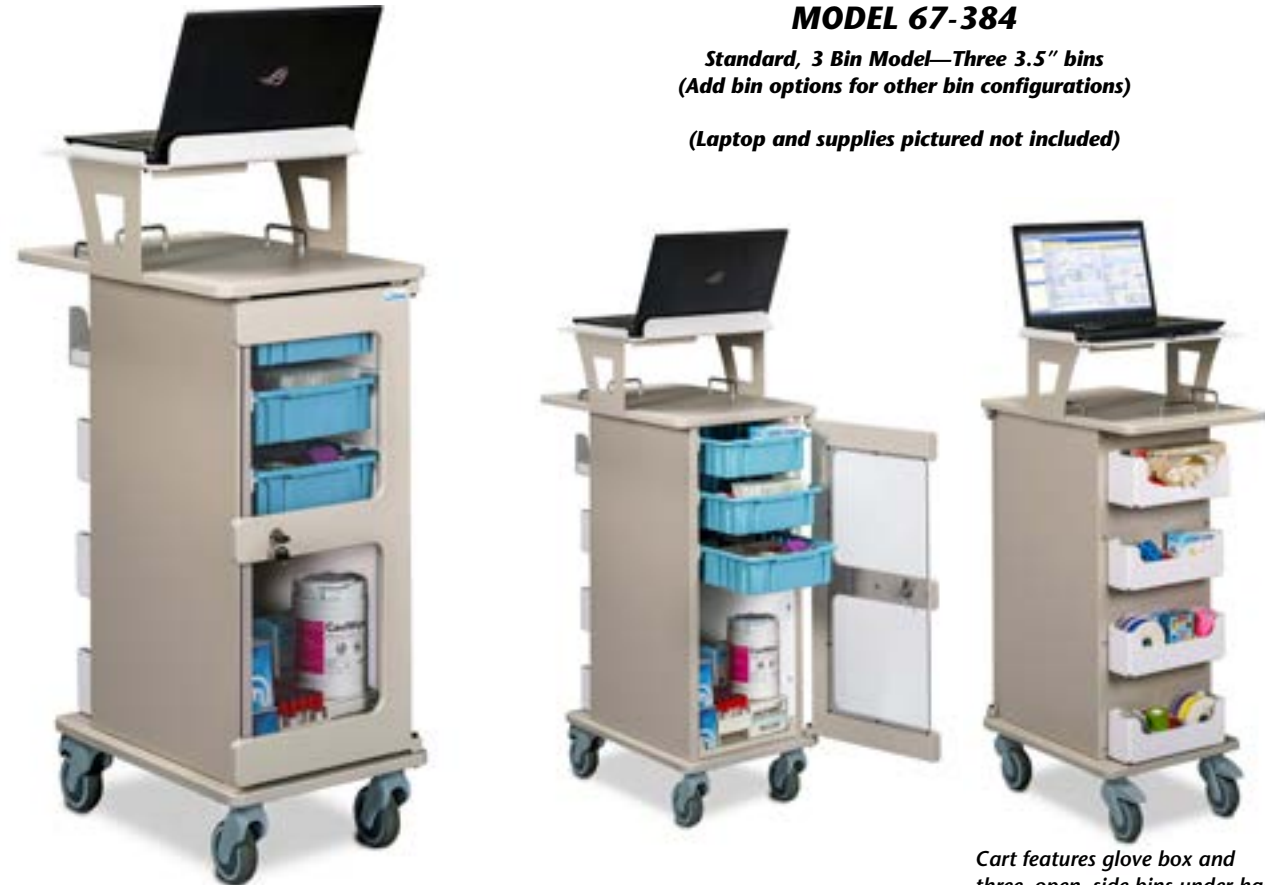
Cart features glove box and three, open, side bins under handle

(Laptop and supplies pictured not included)