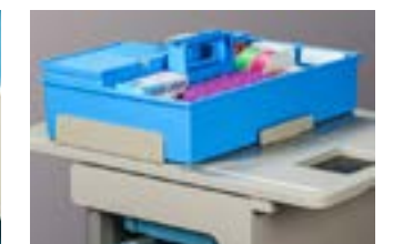
612 Sliding Tray Holder