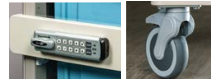
601 Electronic Lock*