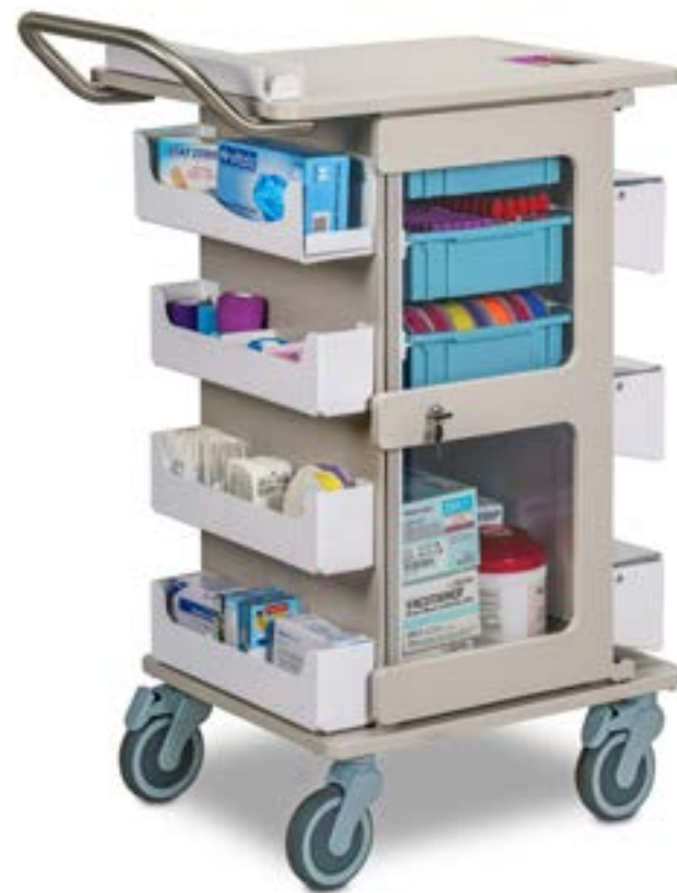
MODEL 67-157 Standard, 3 Bin Model—Three 3.5" bins (Add bin options for other bin configurations)