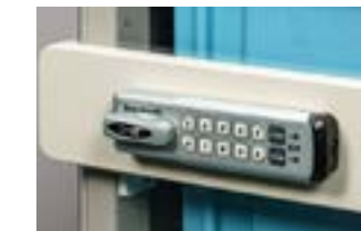
601 Electronic Lock*