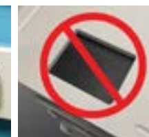
611 No Cutout