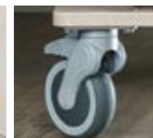
602 Five" Casters