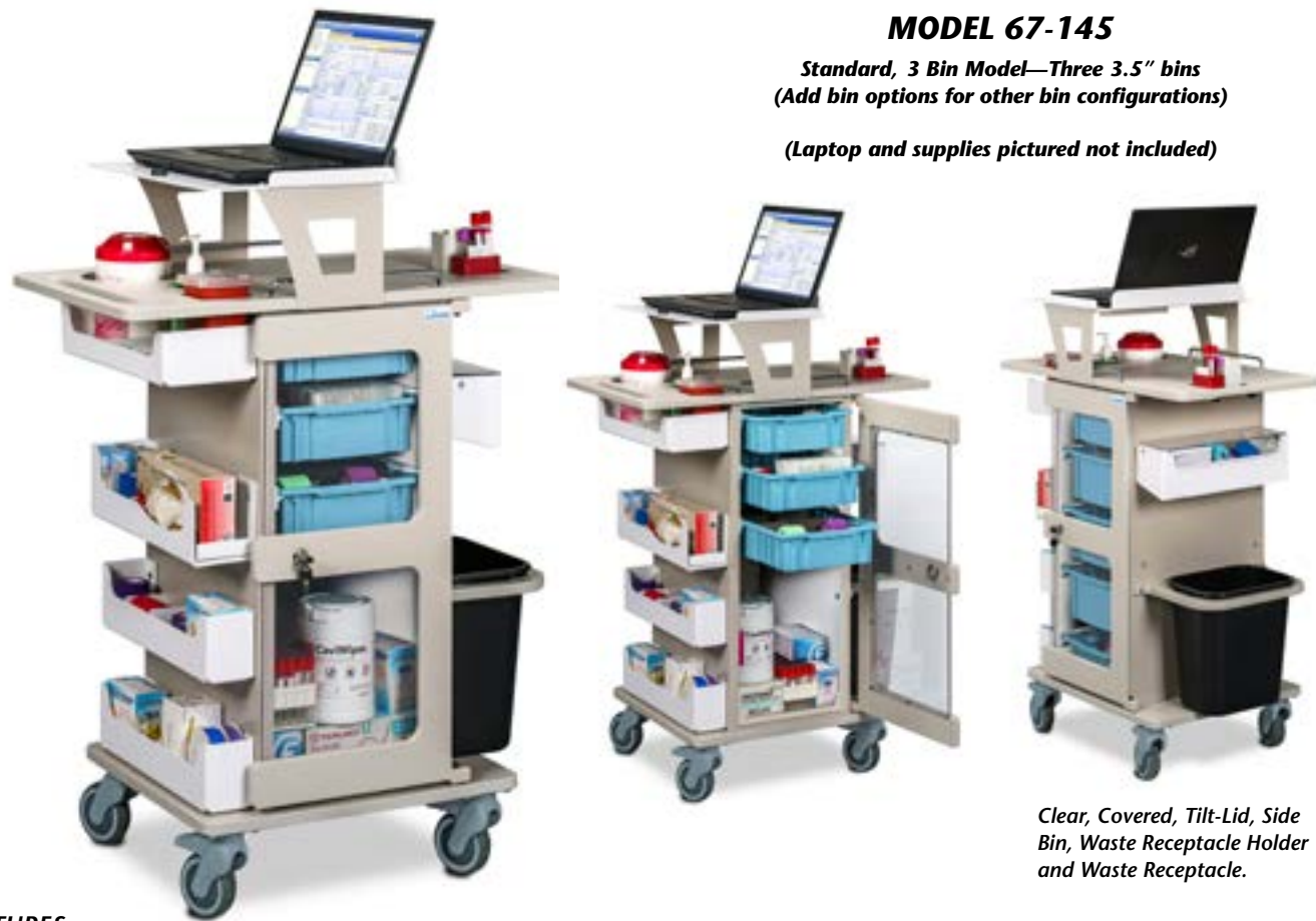
Clear, Covered, Tilt-Lid, Side Bin, Waste Receptacle Holder and Waste Receptacle.

(Laptop and supplies pictured not included)