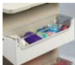
Covered, Tilt-Lid bins and Open, Side Bins for Supplies