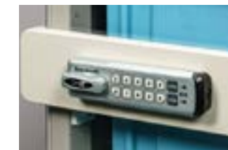
601 Electronic Lock*