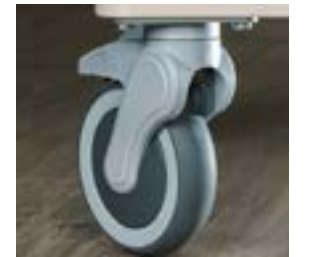
602 5" Casters