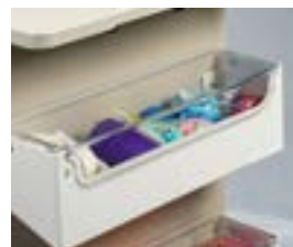
Covered, Tilt-Lid Bins and Open, Side Bins for Supplies