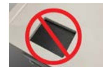
611 No Cutout