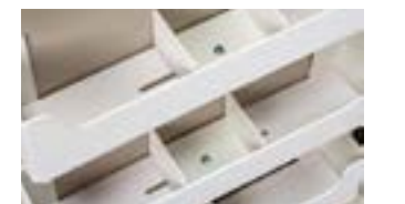
Open, Sliding, Side Bins -610-3 Set of Three, 15.75" x 3" Open, Sliding Tray, Side Bins for left or right side of door