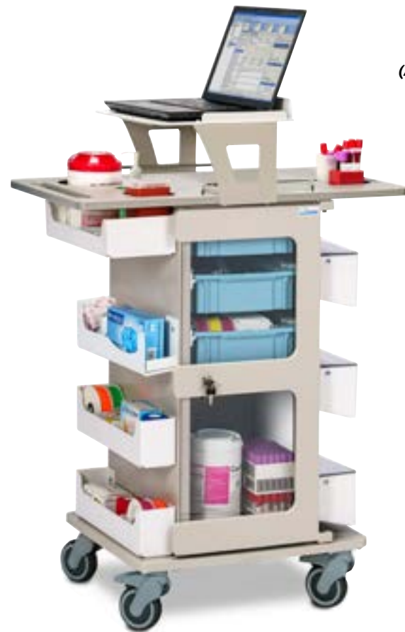
MODEL 67-146 Standard, 3 Bin Model—Three 3.5" bins (Add bin options for other bin configurations) (Laptop and supplies pictured not included)