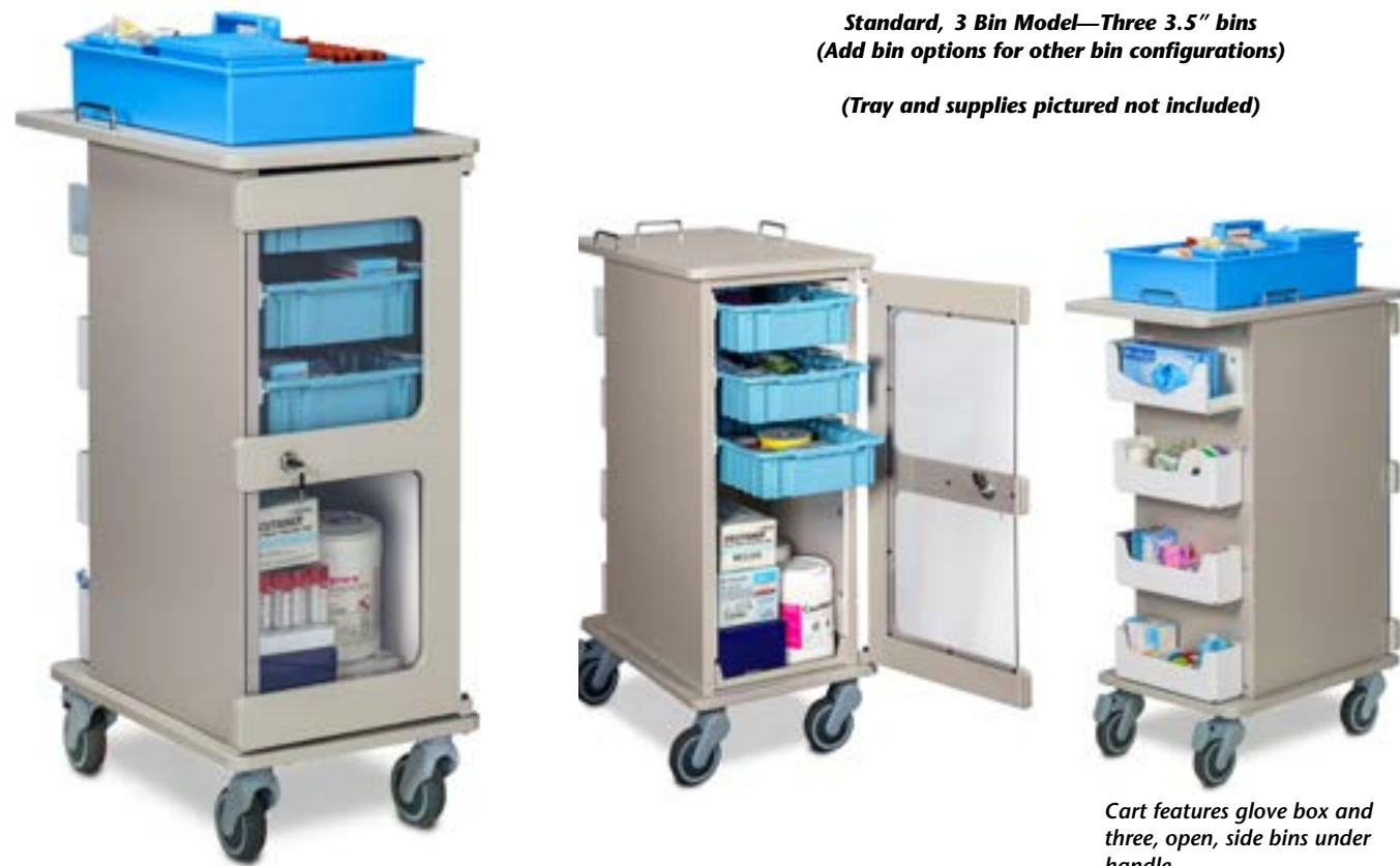
Cart features glove box and three, open, side bins under handle

Standard, 3 Bin Model—Three 3.5" bins (Add bin options for other bin configurations) (Tray and supplies pictured not included)