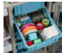
Dividers in Bins