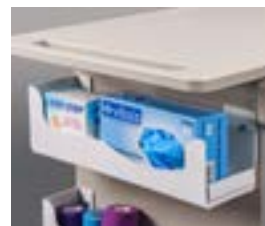
Glove Box Holder