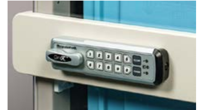
601 Electronic Lock*