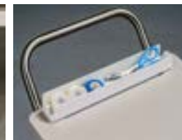
617 Stainless Steel Handle