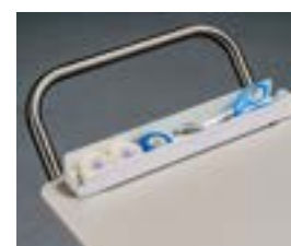
Stainless Steel Handle & Tray