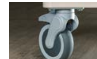
602 Five Inch Casters