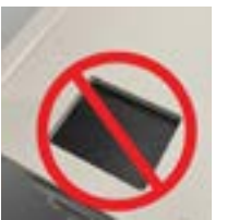
611 No Cutout