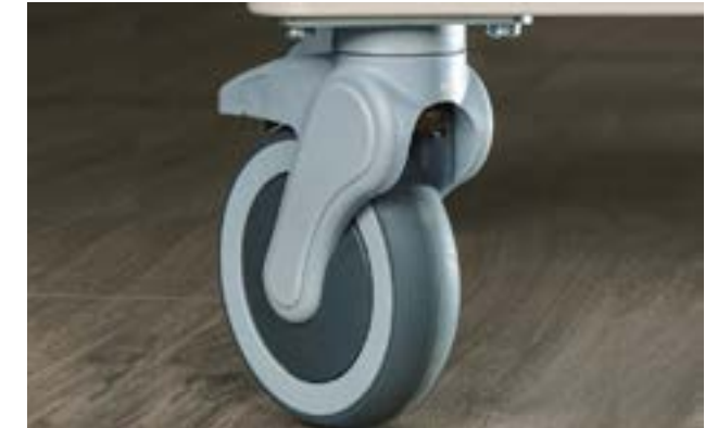
602 5" Casters