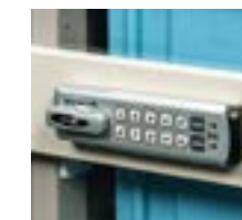
601 Electronic Lock*