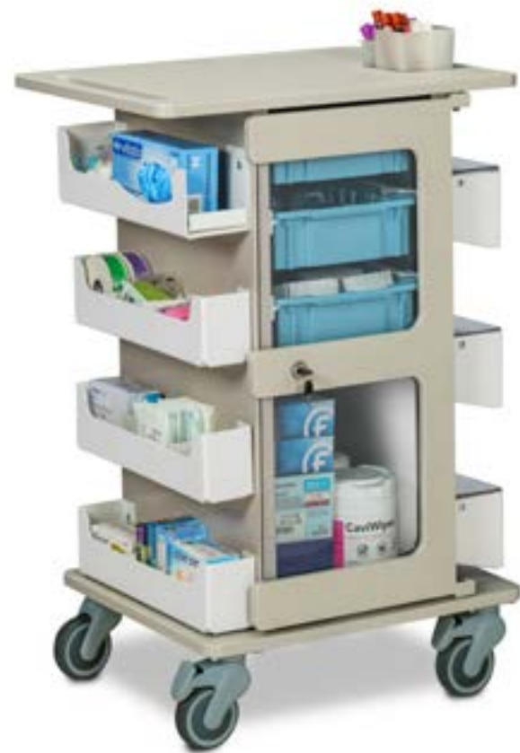
MODEL 67-117 Standard, 3 Bin Model—Three 3.5" bins (Add bin options for other bin configurations) (Supplies pictured not included)