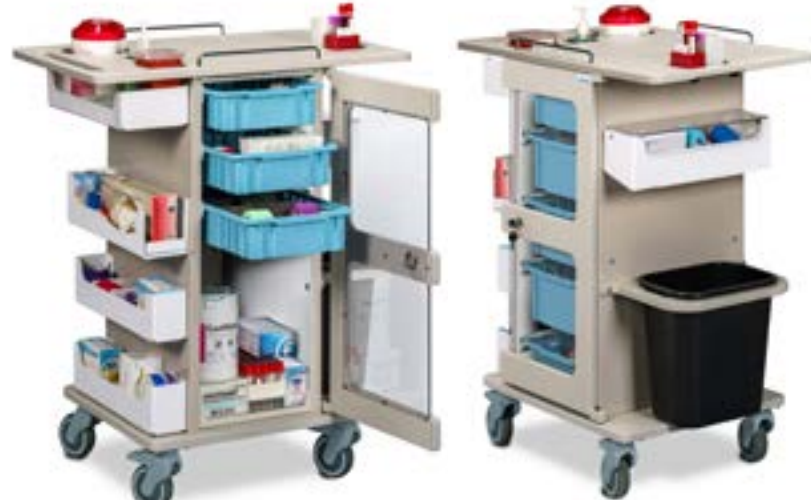
Clear, Covered, Tilt-Lid, Side Bin, Waste Receptacle Holder and Waste Receptacle.