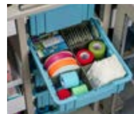
Dividers in Bins