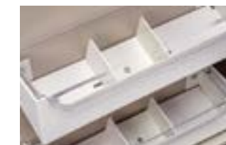
Covered, Sliding, Side Bins -608-3 Set of Three, 15.75" x 4" Covered, Sliding Tray, Side Bins for left or right side of door