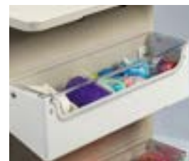
Covered, Tilt-Lid bins and Open, Side Bins for Supplies