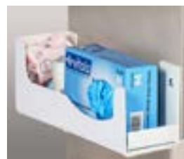
Glove Box Holder