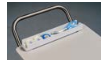
617 Stainless Steel, Push Handle