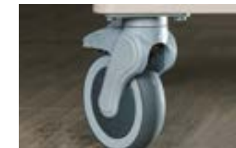
602 5" Casters