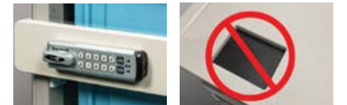
601 Electronic Lock*