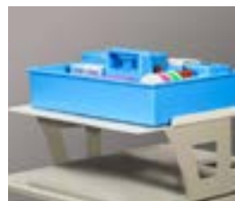
Elevated Surface for Laptop or phlebotomy tray