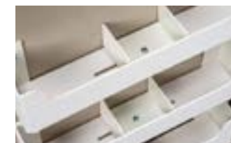
Open, Sliding, Side Bins -610-3 Set of Three, 15.75" x 3" Open, Sliding Tray, Side Bins for left or right side of door