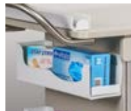
Glove Box Holder