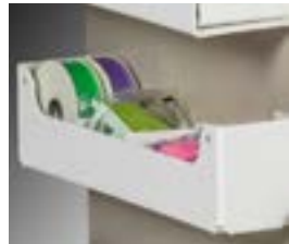
Dividers in Bins