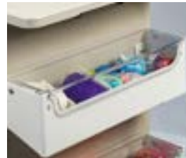
Covered, Tilt-Lid bins and Open, Side Bins for Supplies