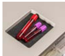
4" x 5" Cutout