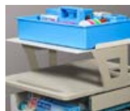
Elevated Surface for tray or laptop