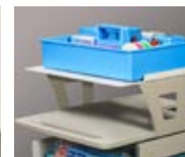
Elevated Surface for Laptop or phlebotomy tray