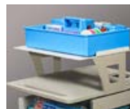
Elevated Surface for Laptop or phlebotomy tray