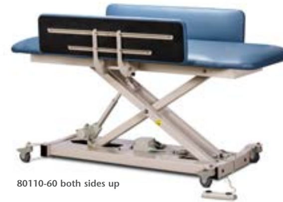
80110-60 both sides up