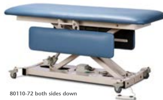
80110-72 both sides down