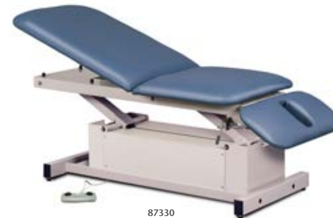
Power-Glide, Hi-Lo, Treatment Table with Adjustable Backrest & Drop Section