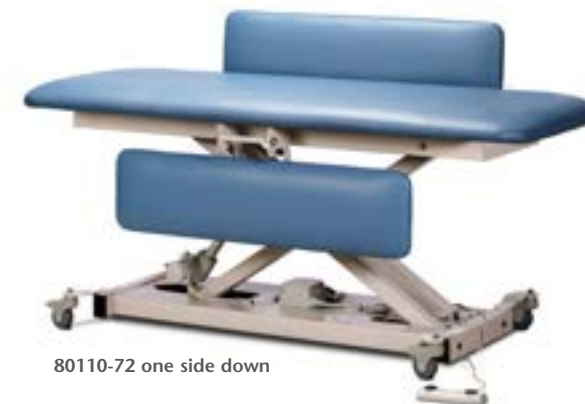
80110-72 one side down