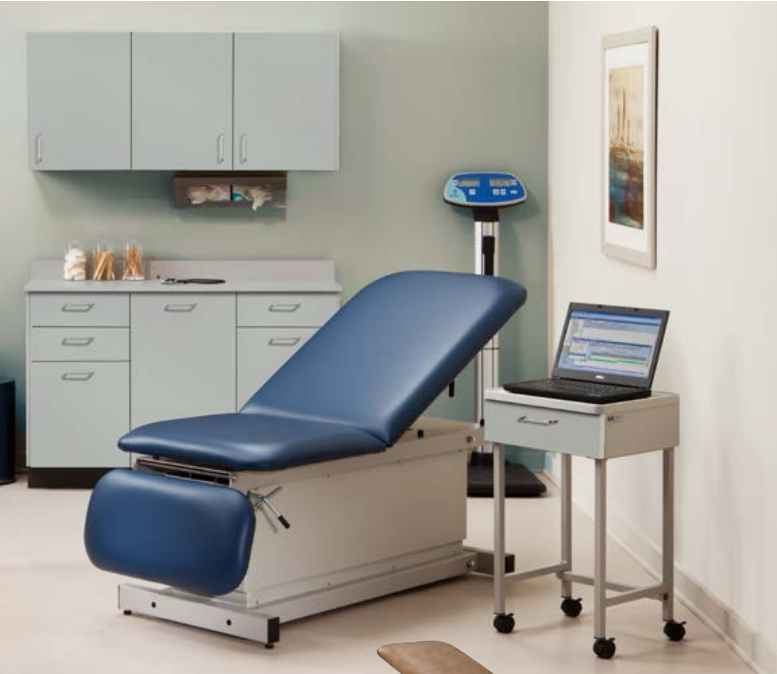
Shown with optional, solid drop section

For more information go to www.P6SWarnings.ca.gov .