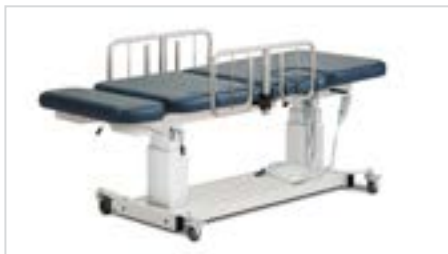
Optional Side Rails & Casters