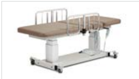
Optional Side Rails & Casters