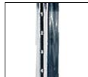
Adjust uprights by number strip on the uprights