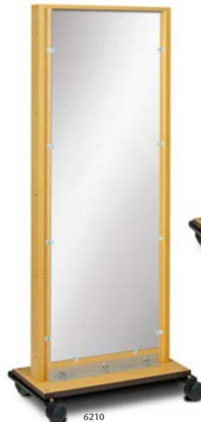
6210 6210-9 Front