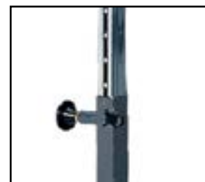
Spring-loaded plungers make adjustments easy