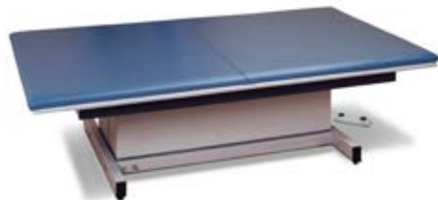
253-57 & 253-68 has seamed upholstery

253-68 8' L x 6' W model (2.43 m x 1.82 m)