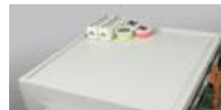
Raised edge on top of both 5101 & 5102 models.