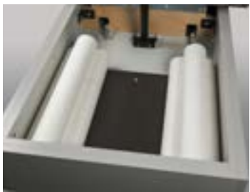
Paper Roll Storage