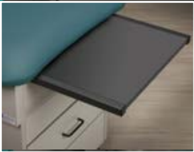
Pull-out, laminate, leg rest

! WARNING: Products featured on this page can expose you to chemicals, including diisononyl phthalate (DINP), which is known to the State of California to cause cancer.