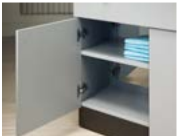
Both Sides Access (8890 & 8870)