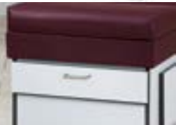
Built-in paper dispenser

! WARNING: This product can expose you to chemicals, including chromium, which is known to the State of California to cause cancer or reproductive toxicity. For more information go to www.P65Warnings.ca.gov .