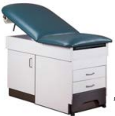
8844 Stool Stored

! WARNING: Products featured on this page can expose you to chemicals, including chromium, which is known to the State of California to cause cancer or reproductive toxicity.