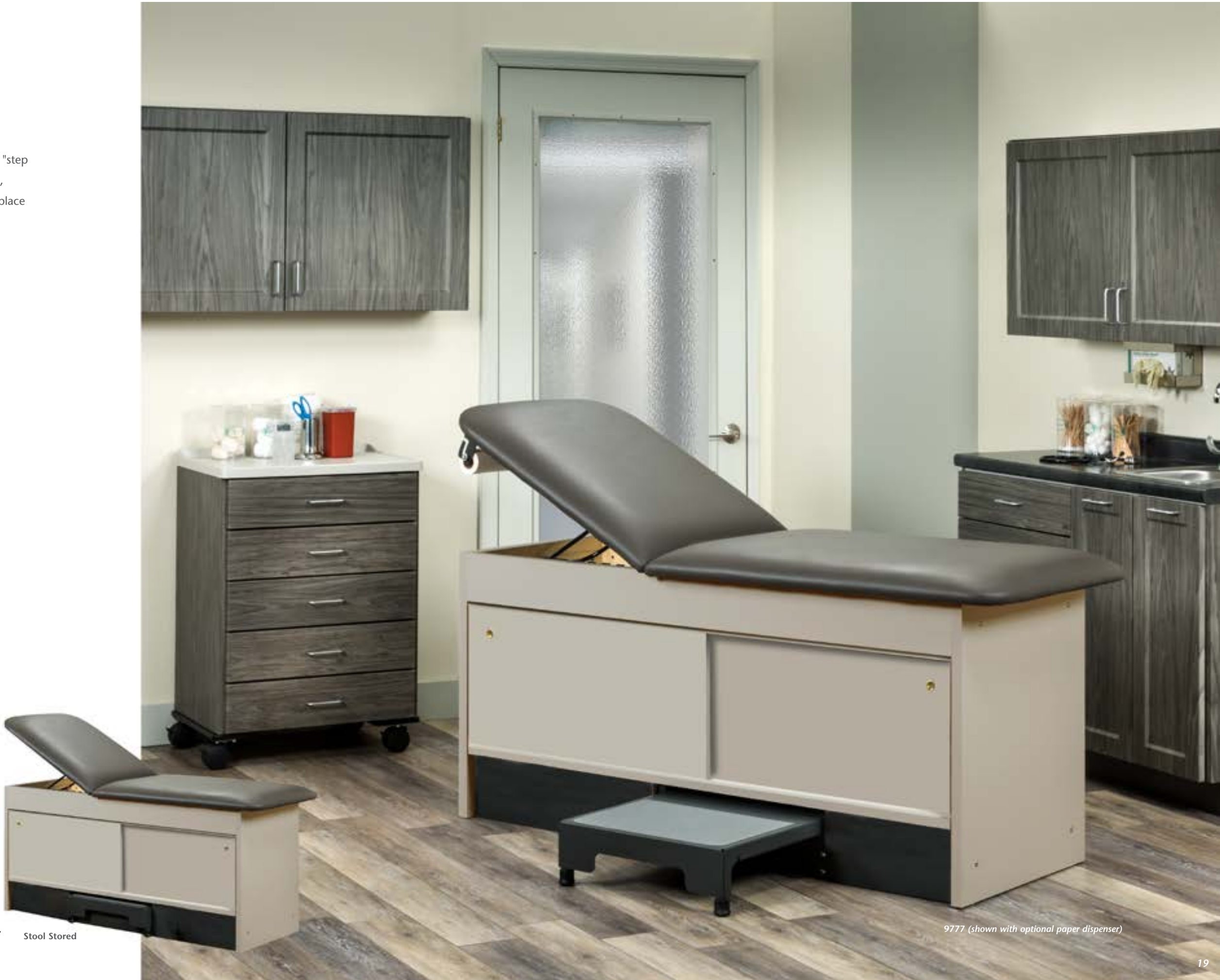
9777 (shown with optional paper dispenser)

For more information go to www.P65Warnings.ca.gov .