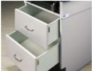
2 drawer storage (8890 & 8870)