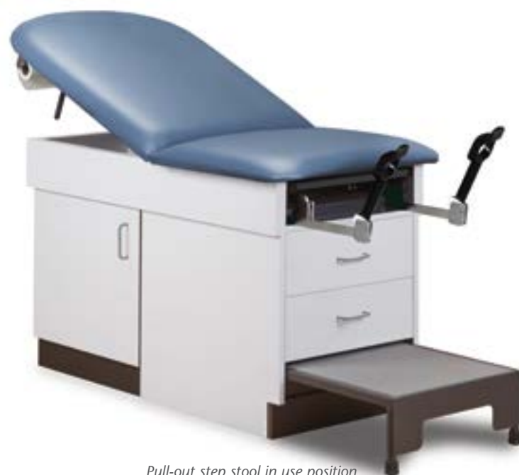
Pull-out step stool in use position