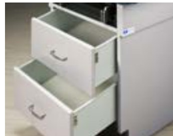
2 drawer storage (8890 & 8870)