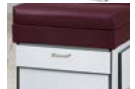
Built-in paper dispenser

! WARNING: This product can expose you to chemicals, including chromium, which is known to the State of California to cause cancer or reproductive toxicity.