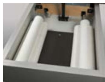
Paper Roll Storage