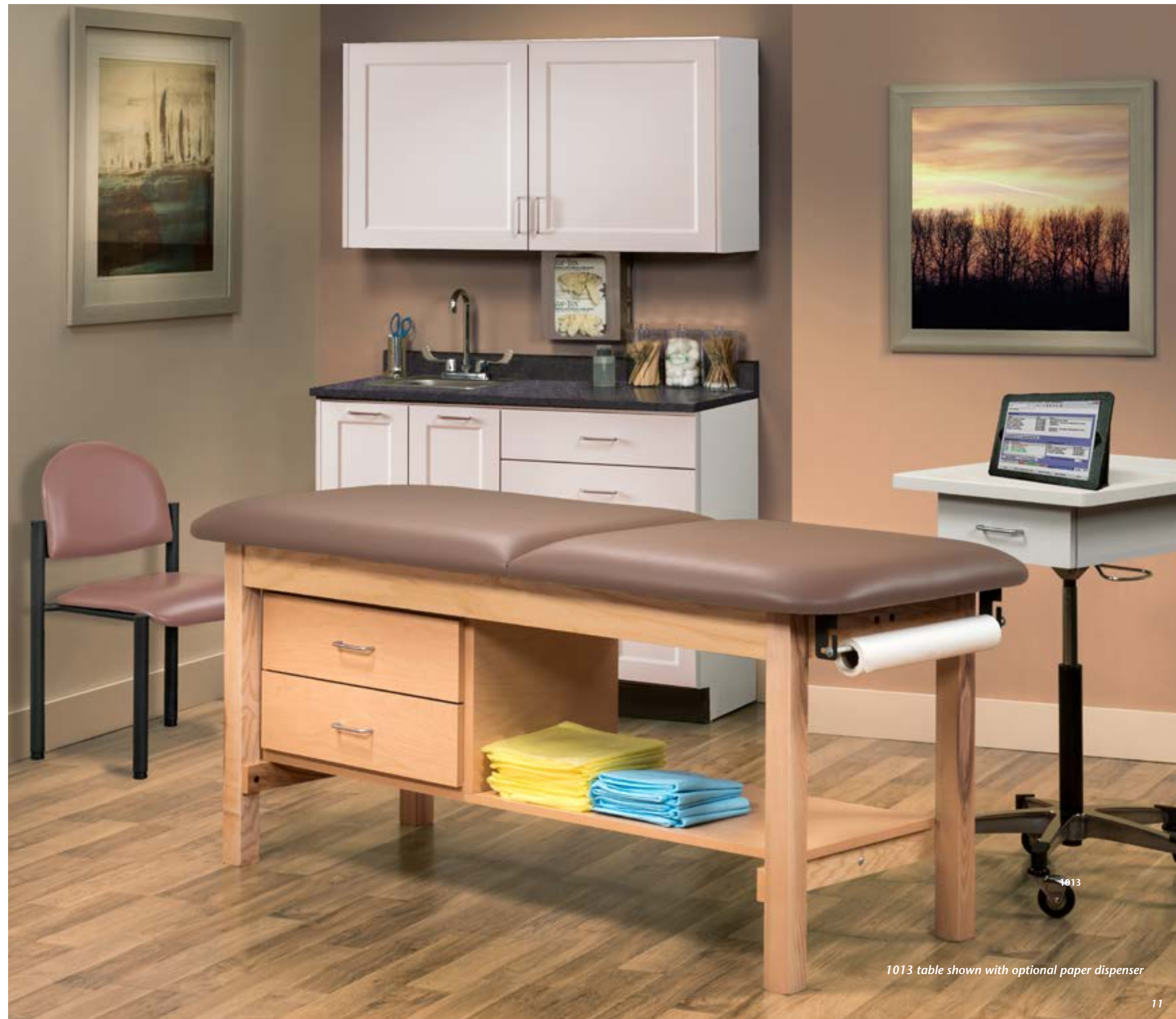
1013 table shown with optional paper dispenser

10 For more information go to www.P65Warnings.ca.gov .