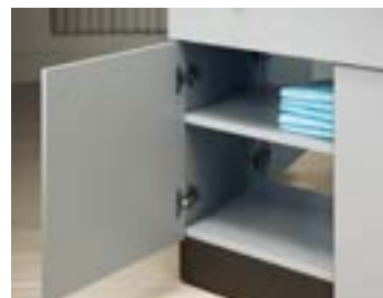
Both Sides Access (8890 & 8870)