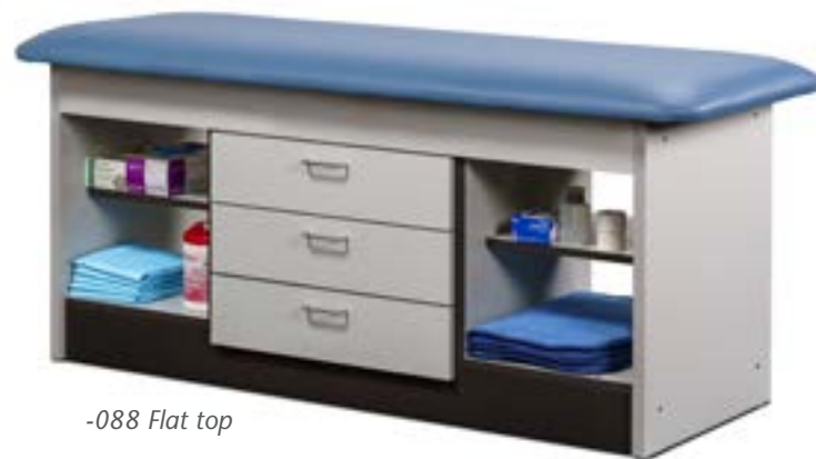
-088 Flat top