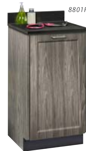
18" Laminate, Treatment Cabinet with 1 Door