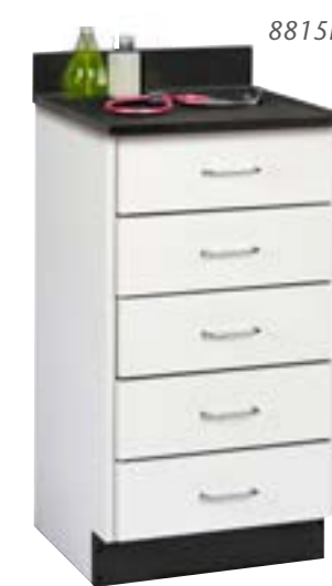
18" Laminate, Treatment Cabinet with 5 Drawers