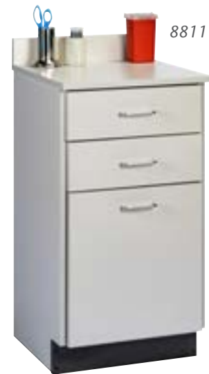
18" Laminate, Treatment Cabinet with 1 Drawer and 1 Door