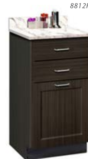
18" Laminate, Treatment Cabinet with 2 Drawers and 1 Door