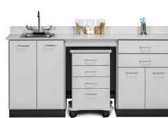
48072SL Shown with Optional -022 Sink