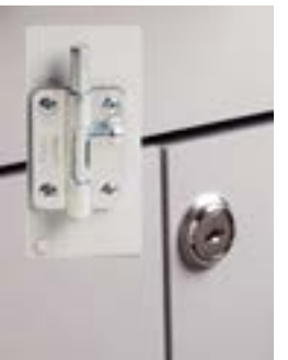
066 Door Locks & Inside Latch