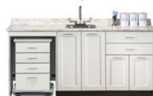
58072ML Shown with Optional -022 Sink