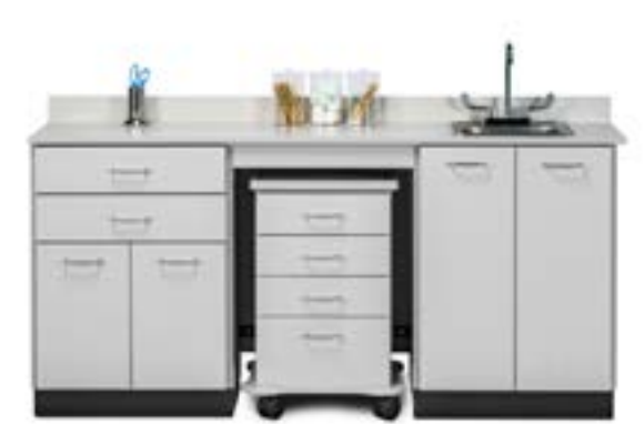
48072SR Shown with Optional -022 Sink