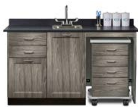
58060MR Shown with Optional -022 Sink

⚠ WARNING: This product can expose you to chemicals, including chromium, which is known to the State of California to cause cancer and reproductive harm.