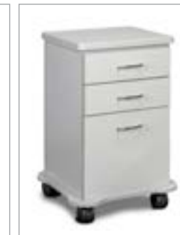
043—2 drawers & 1 door