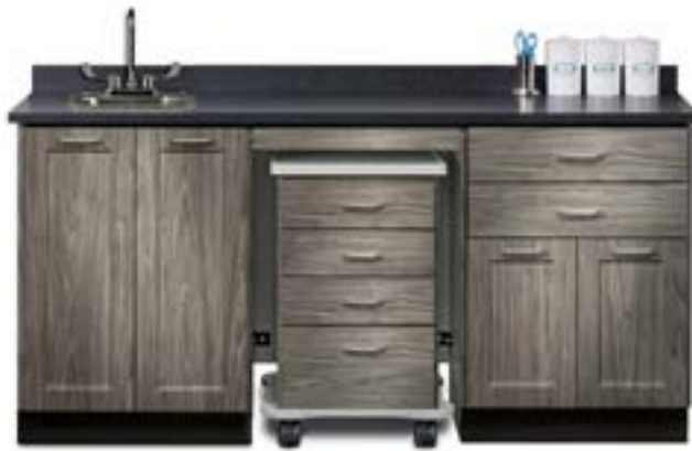
58072SL Shown with Optional -022 Sink