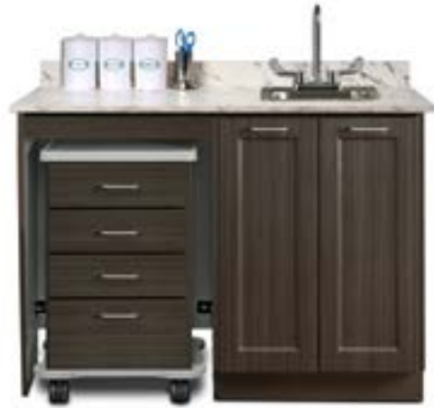
58048L Shown with Optional -022 Sink