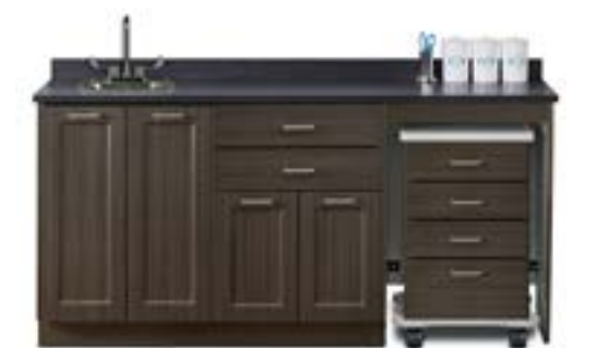
58072R Shown with Optional -022 Sink