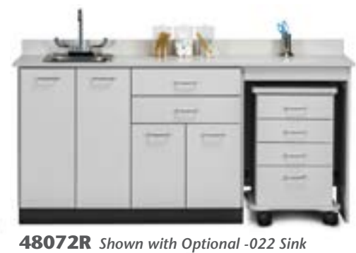
48072R Shown with Optional -022 Sink