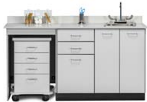
48066L Shown with Optional -022 Sink