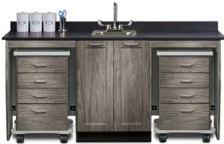
58072D Shown with Optional -022 Sink