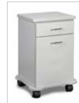
042—1 drawer & 1 door