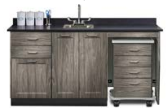
58066MR Shown with Optional -022 Sink