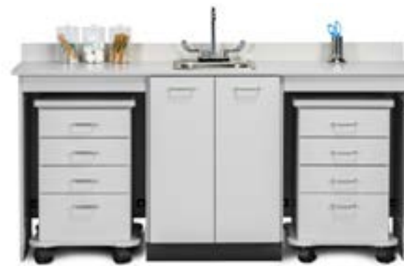
48072D Shown with Optional -022 Sink