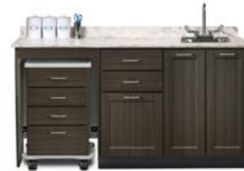
58066L Shown with Optional -022 Sink