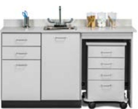
48060MR Shown with Optional -022 Sink

! WARNING: This product can expose you to chemicals, including chromium, which is known to the State of California to cause cancer and reproductive harm.