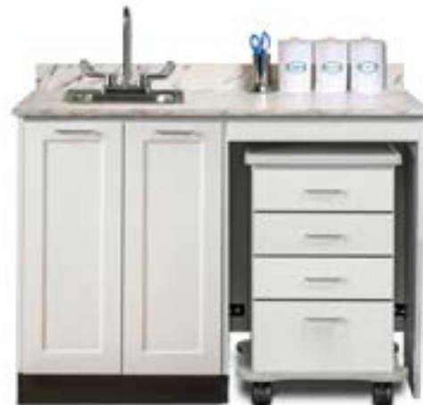
58048R Shown with Optional -022 Sink