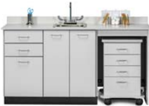
48066MR Shown with Optional -022 Sink