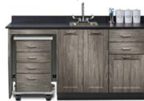
58066ML Shown with Optional -022 Sink