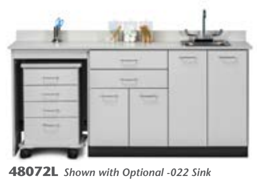
48072L Shown with Optional -022 Sink