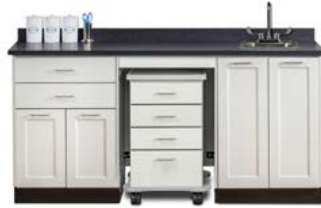
58072SR Shown with Optional -022 Sink