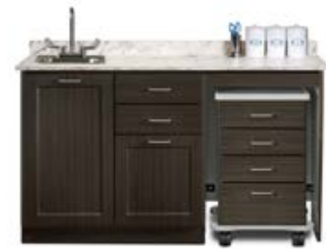
58060R Shown with Optional -022 Sink