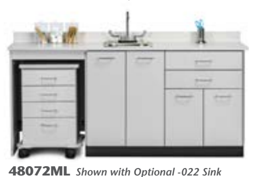
48072ML Shown with Optional -022 Sink