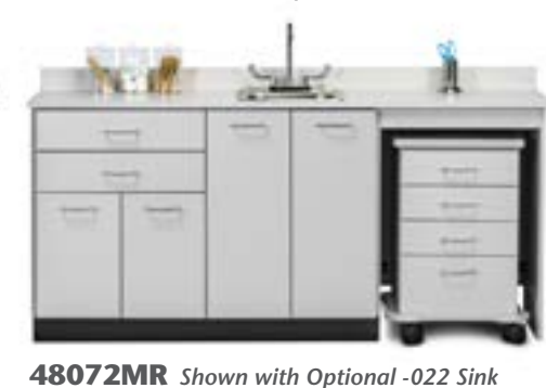
48072MR Shown with Optional -022 Sink

⚠ WARNING: This product can expose you to chemicals, including chromium, which is known to the State of California to cause cancer and reproductive harm.