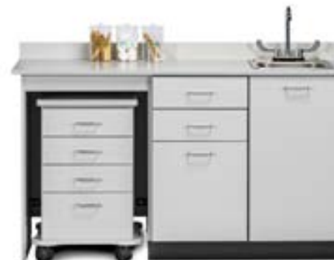
48060L Shown with Optional -022 Sink