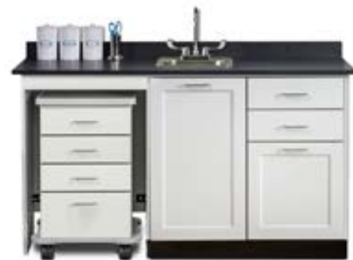
58060ML Shown with Optional -022 Sink