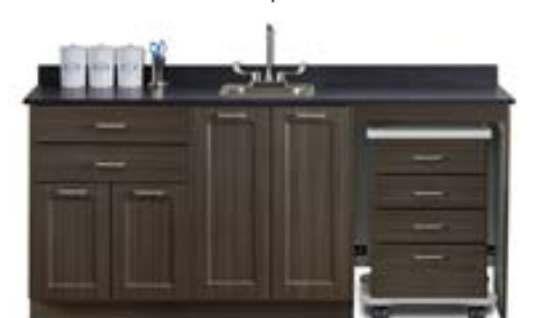
58072MR Shown with Optional -022 Sink

⚠ WARNING: This product can expose you to chemicals, including chromium, which is known to the State of California to cause cancer and reproductive harm.