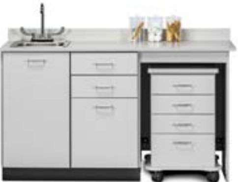
48060R Shown with Optional -022 Sink