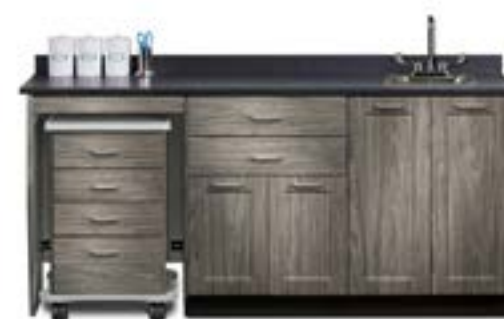
58072L Shown with Optional -022 Sink