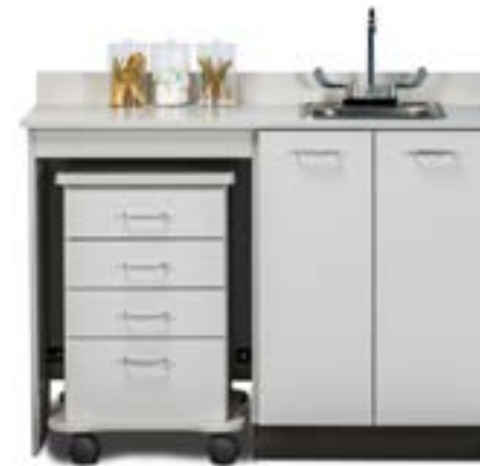
48048L Shown with Optional -022 Sink