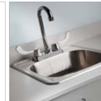
022 Stainless Steel Sink and Gooseneck Chrome Faucet set