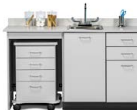
48060ML Shown with Optional -022 Sink