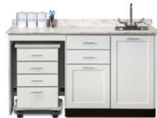
58060L Shown with Optional -022 Sink