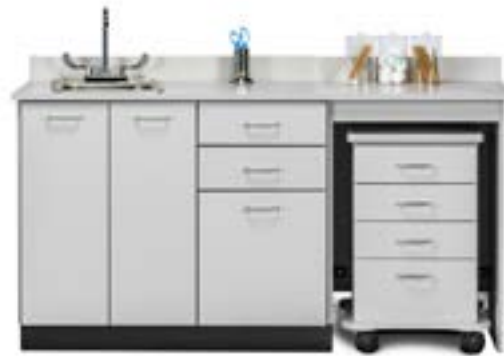
48066R Shown with Optional -022 Sink