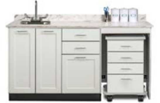
58066R Shown with Optional -022 Sink