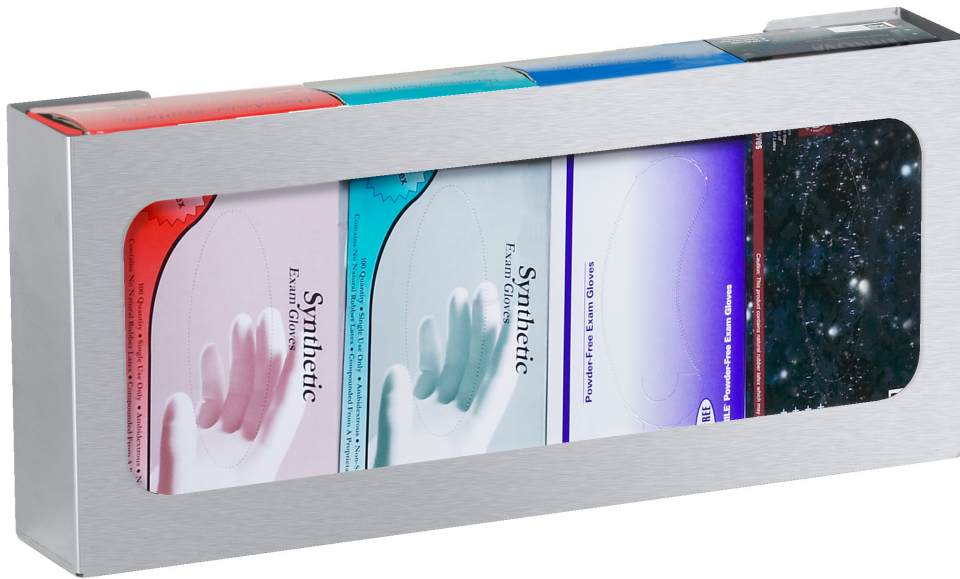
Shown in the horizontal position