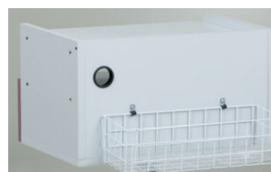
089 Optional wire basket