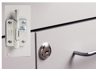
066 Door and Inside Latch Combo