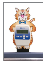
078-K Kitty Scale Pal