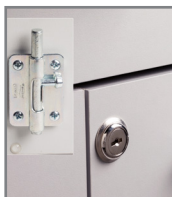
066 Door & Inside Latch Combo