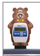
078-B Bear Scale Pal