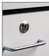
055 Drawer Locks