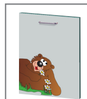
Select Series Graphics