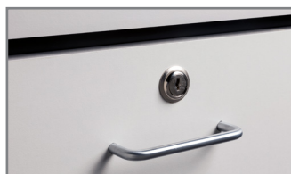
055 Drawer Locks