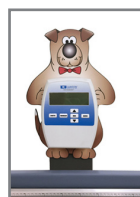
078-D Doggie Scale Pal