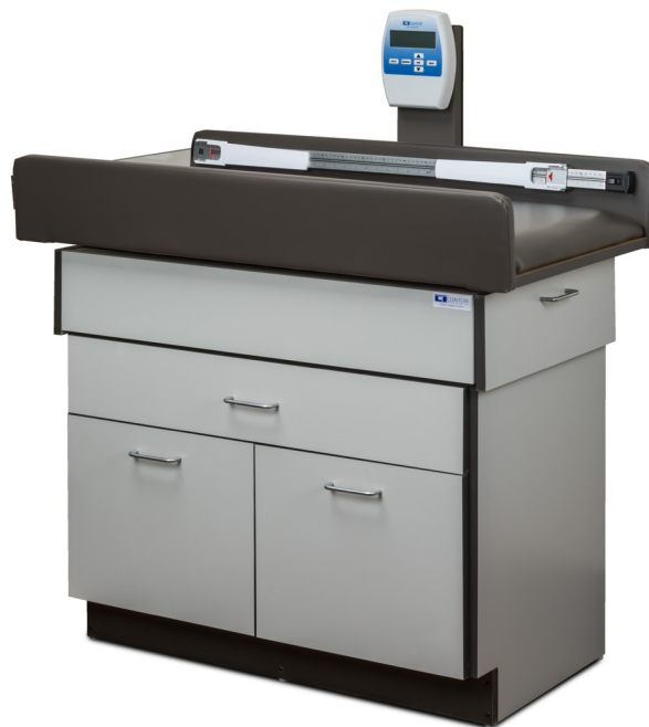
MODEL 7830 SPECIFICATIONS