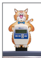
078-K Kitty Scale Pal