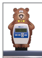
078-B Bear Scale Pal