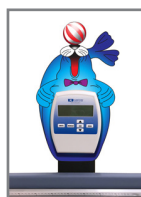
078-S Seal Scale Pal