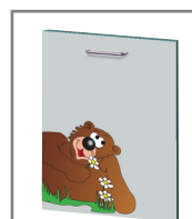
Select Series Graphics