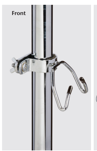
IV-56 Drainage Hook