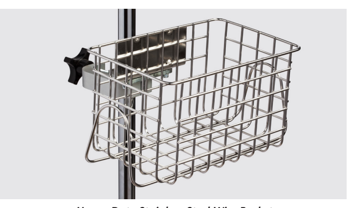
Heavy Duty Stainless Steel Wire Basket IV-515 –14" x 8" x 8.5" IV-525 –12" x 6" x 6.5"