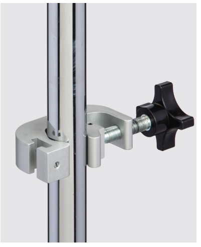
IV-41 Universal Clamp