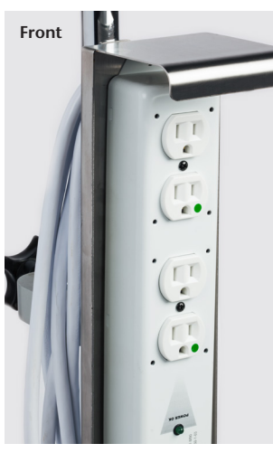
IV-50 Pole Outlet Strip