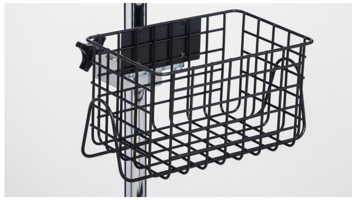
Heavy Duty Black Epoxy Wire Basket IV-51B-14" x 8" x 8.5" IV-52B-12" x 6" x 6.5"