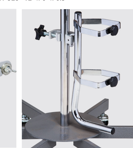
IV-44 Oxygen Cylinder Holder