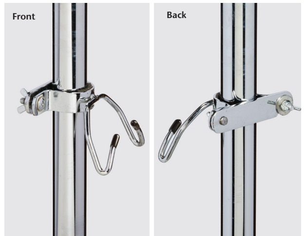
IV-56 Drainage Hook