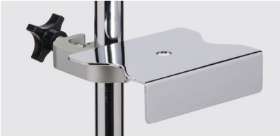
IV-46 Pump Tray Support