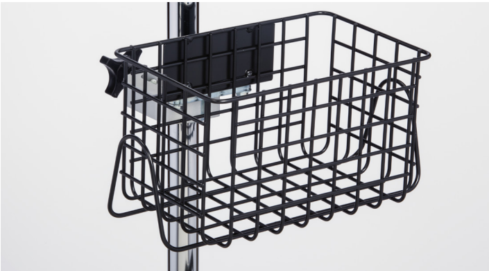
Heavy Duty Black Epoxy Wire Basket IV-51B – 14" x 8" x 8.5" IV-52B – 12" x 6" x 6.5"