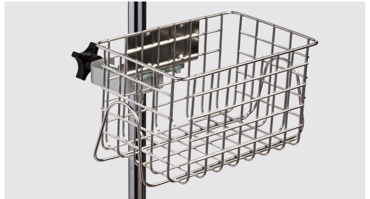
Heavy Duty Stainless Steel Wire Basket IV-51S – 14" x 8" x 8.5" IV-52S – 12" x 6" x 6.5"