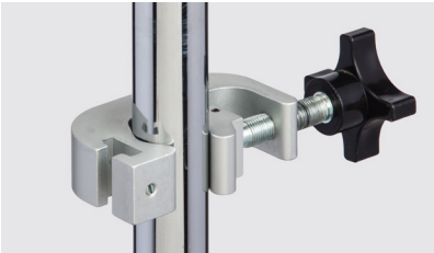
IV-41 Universal Clamp