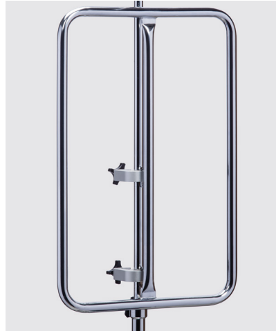
IV-42 Infusion Pump Frame