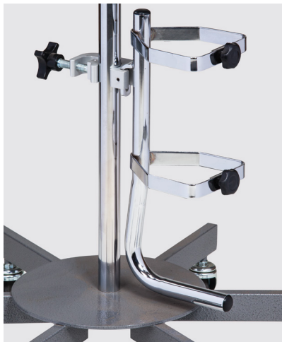
IV-44 Oxygen Cylinder Holder