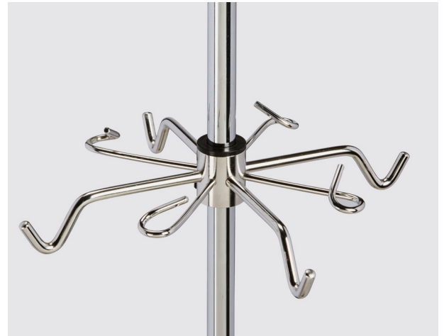
IV-55 Extra Hooks and Organizer Hooks