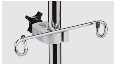
IV-57 Single Ram's Horn