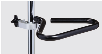
IV-43 Steering Handle