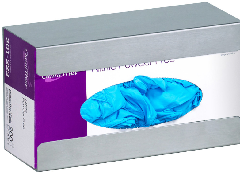
Shown in the horizontal position