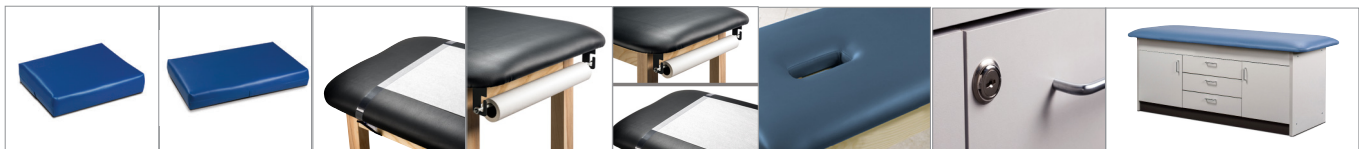
20– Small Pillow