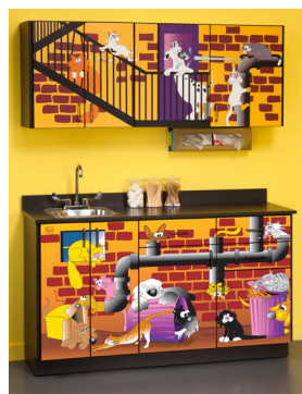
Alley Cats & Dogs