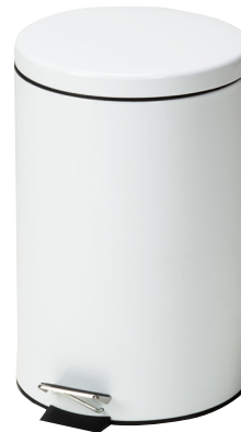
TR-20W White Enamel Steel