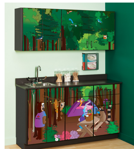
Cool Park Campgrounds Cabinets