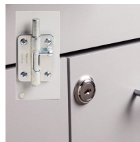
066 Door Locks & Inside Latch