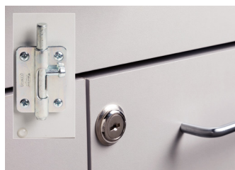
066 Door and Inside Latch Combo