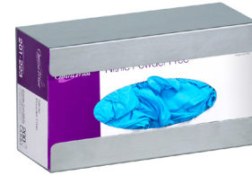
Shown in the horizontal position