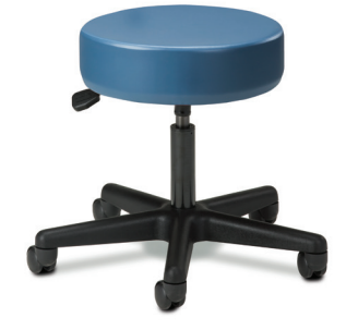
Prop 65 Warning

WARNING: This product can expose you to chemicals, including diisononyl phthalate (DINP), which is known to the State of California to cause cancer. For more information go to www.P65Warnings.ca.gov.