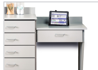
076 Wall Mount Desk with 1 Leg & 1 Drawer