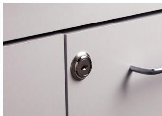
055 Door & Drawer Locks