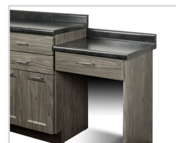
076-FP Desk/postform top