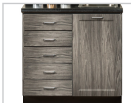
044-FF 5 Drawer Option