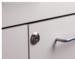
055 Drawer & Door Locks