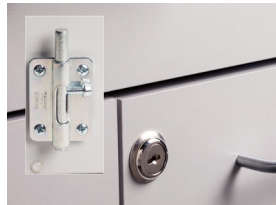
066 Door Locks & Latch Combo