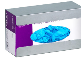
Shown in the horizontal position