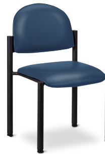
Prop 65 Warning