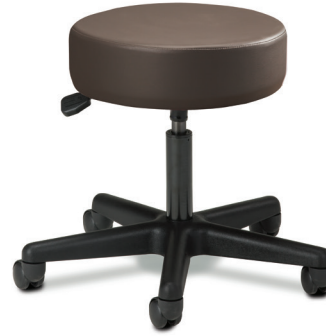
Prop 65 Warning