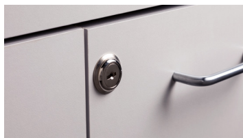
055 Door Locks