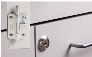
066 Door Lock & Latch Combo