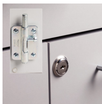
066 Door Lock & Inside Latch Combo