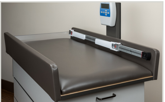
Padded Top Easy-clean, padded, upholstered top for comfort

Rimmed Top with Beveled Edges Top is rimmed on three sides for safety and the front and back rim edges are beveled and the corners rounded for safety