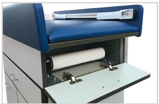
Paper Dispenser Choose to access concealed paper dispenser from either end

Infantometer Built-in infantometer with folding ends for measuring height