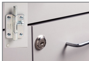
066 Door & Inside Latch Combo