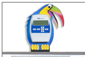
78-P Parrot Scale Pal