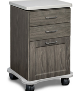
043 Cart Option