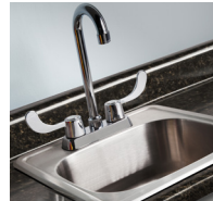
022 Stainless Steel Sink & Chrome Faucet