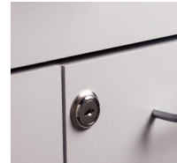
055 Door Locks