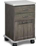
043 Cart Option