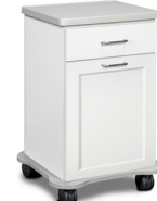
042 Cart Option