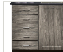
044 Add a Drawer