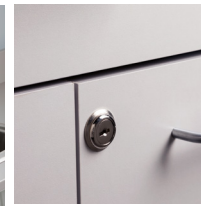
055 Door & Drawer Locks