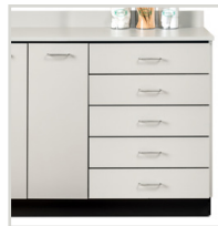
044 Add a Drawer