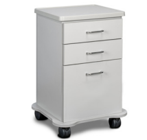
043 Cart Option