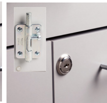
066 Door Locks & Inside Latch