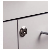
055 Door & Drawer Locks