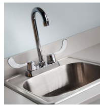
022 Stainless Steel Sink & Chrome Faucet