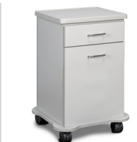
042 Cart Option