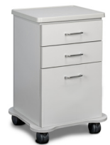
043 Cart Option