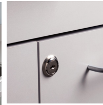
055 Door & Drawer Locks