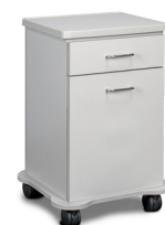
042 Cart Option