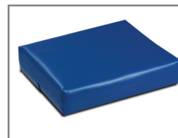
20 Small Pillow