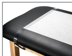
040 Paper Cutter