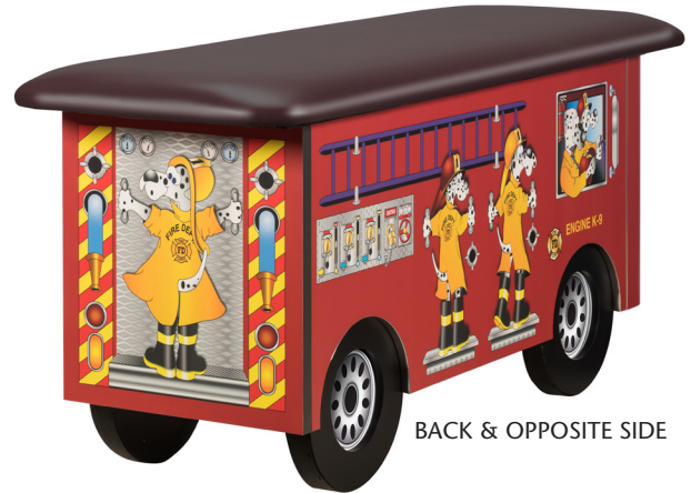
BACK & OPPOSITE SIDE