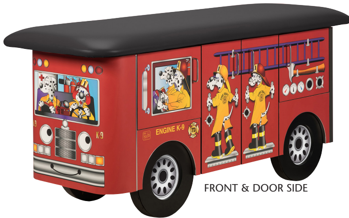
FRONT & DOOR SIDE