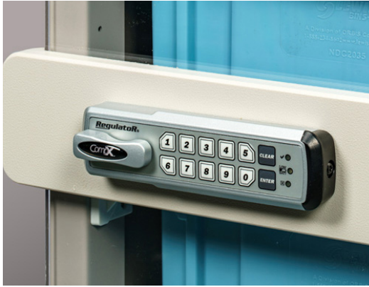
-601 Electronic Lock (2 locks needed for locking both top and bottom of cart)

NOTE: Electronic Lock not intended to secure narcotics or other restricted items.