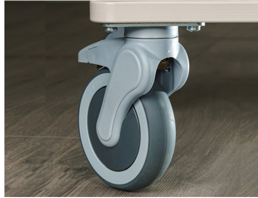
-602 Five inch Casters (upgrade from 4 inch)

NOTE: Electronic Lock not intended to secure narcotics or other restricted items.