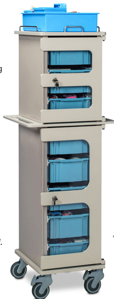
MODEL 67-2480 Six 5" Bins & Two 3.5" Bin