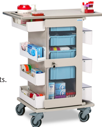
67-136 with option 304 Three 3.5" Bins & One 5" Bin