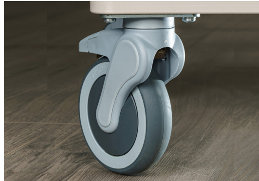
-602 Five inch Casters (upgrade from 4 inch)

NOTE: Electronic Lock not intended to secure narcotics or other restricted items.