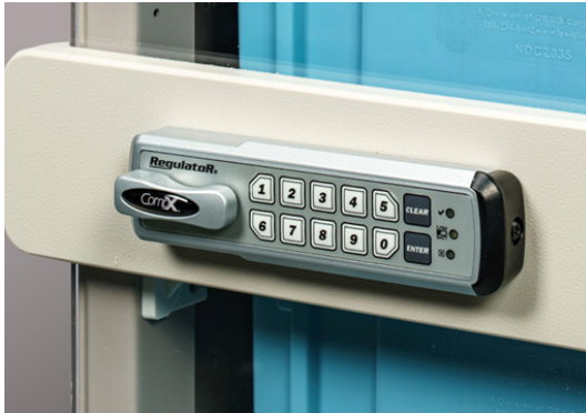
-601 Electronic Lock

NOTE: Electronic Lock not intended to secure narcotics or other restricted items.