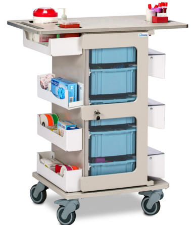
67-136 with option 305 Four 5" Bins & One 3.5" Bin