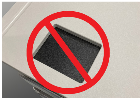
-611 No 4" x 5" Cutout—No Charge