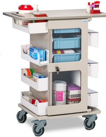
MODEL 67-136 Three 3.5" Bins