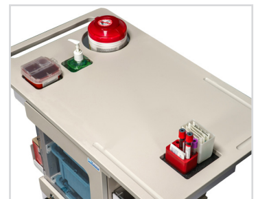
Top Cutout 4" x 5" Cutout for stabilizing objects, plus three special cutout for additional supplies.