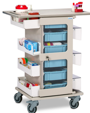
67-136 with option 306 Six 3.5" Bins