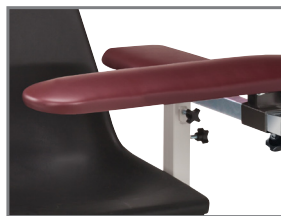
600 Padded, Armrest and Flip Arm