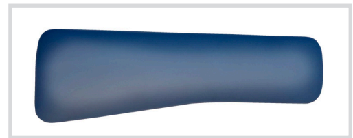
Comfort-form arms accommodates both arm and hand for a more relaxed draw.

All blood drawing products are non-returnable unless they are unused in unopened, original packaging.