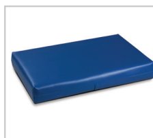
060 Large Pillow