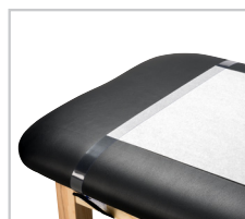
040 Paper Cutter