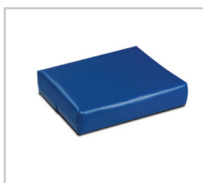
020 Small Pillow