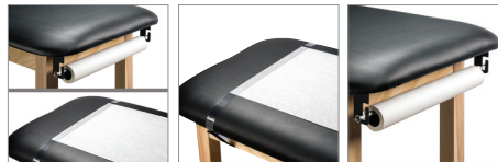
034- Paper Dispenser & Cutter Combo