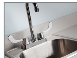
22 Sink & Faucet