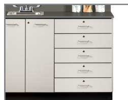
044 Add a Cabinet Drawer