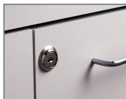
055 Door Locks