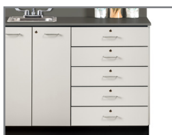
044 Add a Cabinet Drawer