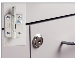
066 Door & Inside Latch Combo