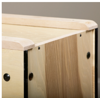
Two, bottom runners