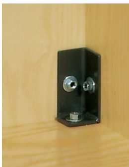
Two, triple-bolted corners for extra strength