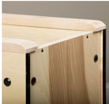
Two, bottom runners