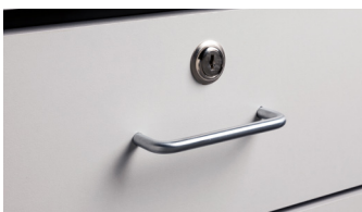
055 Drawer & Door Locks