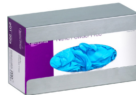
Shown in the horizontal position

*Clinton stainless steel items are not M.R.I. compatible.